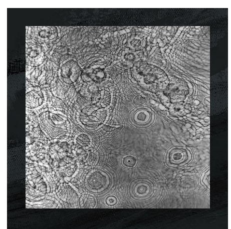
Nikala Bourke, Browns River Photogram 2 , 2021, original black and white, water photogram, silver gelatin paper, 156 x 122 cm