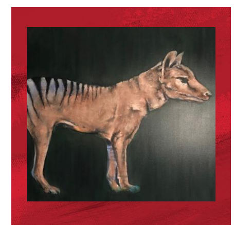
Emma Margetts, Thylocine II , 2022, acrylic on canvas, 122 x 184 cm (Cropped)

Selections from The Pull of Water are presented in collaboration with Penny Contemporary.