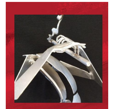
Matt Carney, Flutist, steel, 86 x 31 x 25 cm (Cropped) $2,400