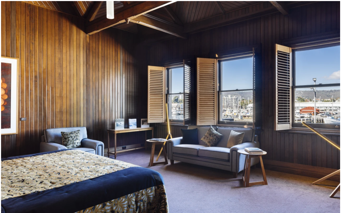
The luxurious H. Jones Suite overlooking Hobart's waterfront, with the Tasmanian blackwood ceilings and wall panelling of the old boardroom.