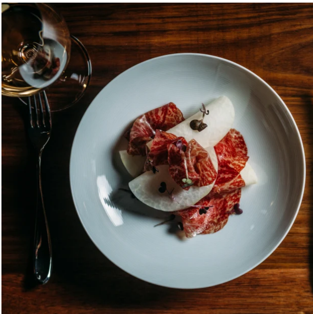
Artfully-presented food in the Landscape Restaurant.