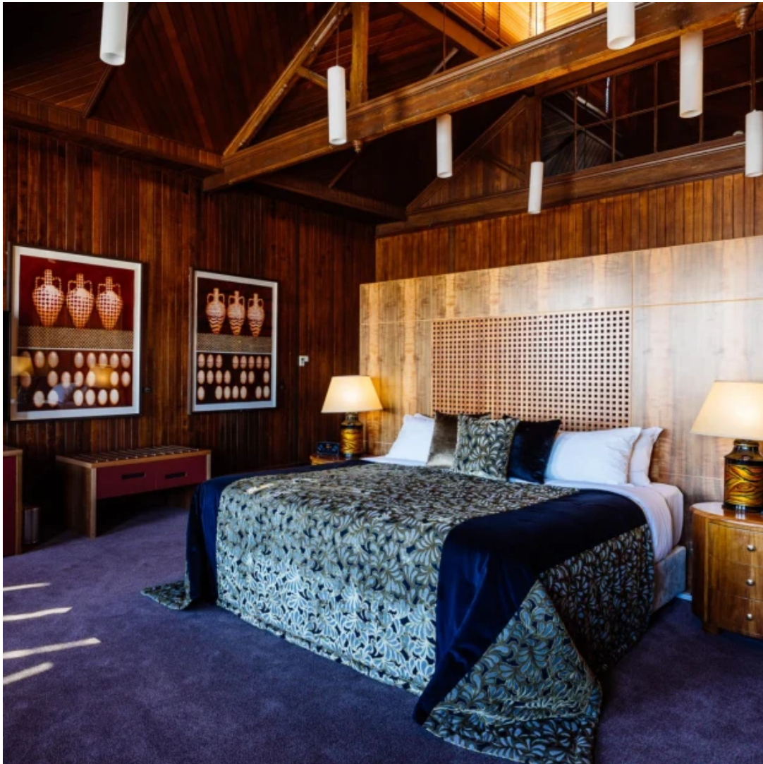
Bringing art and history together: the grand H. Jones Suite.

All the rooms have their own distinctive qualities – exposed timber and brickwork, perhaps a remnant factory pulley hanging from the ceiling. But the top suite (from $740 a night) stands apart with its Tasmanian Blackwood ceilings and wall panelling and views of Hobart's waterfront. And, of course, the art.