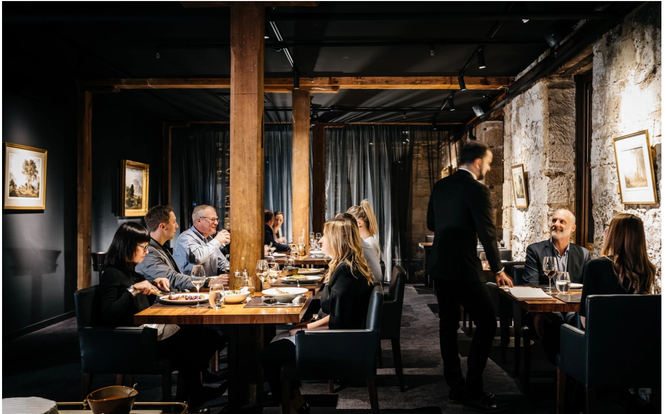
Paintings by 19th century artist John Glover inspired and are a feature of Landscape Restaurant & Grill.

Much of the restaurant's inspiration was drawn from Glover's hopeful depiction of the early colony. Its main focus, though, is showcasing fresh seasonal produce from farmers around the state.