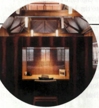
184 The Australian Women's Weekly

Hikers, beach lovers and nature lovers, rejoice! There's a spectacular new multi-day Australian coastal walk to add to your wish list. The 34km Murramarang South Coast Walk showcases the beauty of Murramarang National Park in NSW, and hugs the coastline between Pretty Beach, south of Ulladulla, and Maloneys Beach on the northern shore of Batemans Bay. It's best appreciated on self-guided 3-day, 3-night camping packages or 2-night, 3-day cabin packages, but easy half-day and full-day walks are possible too. See nswparks.info/MSCW